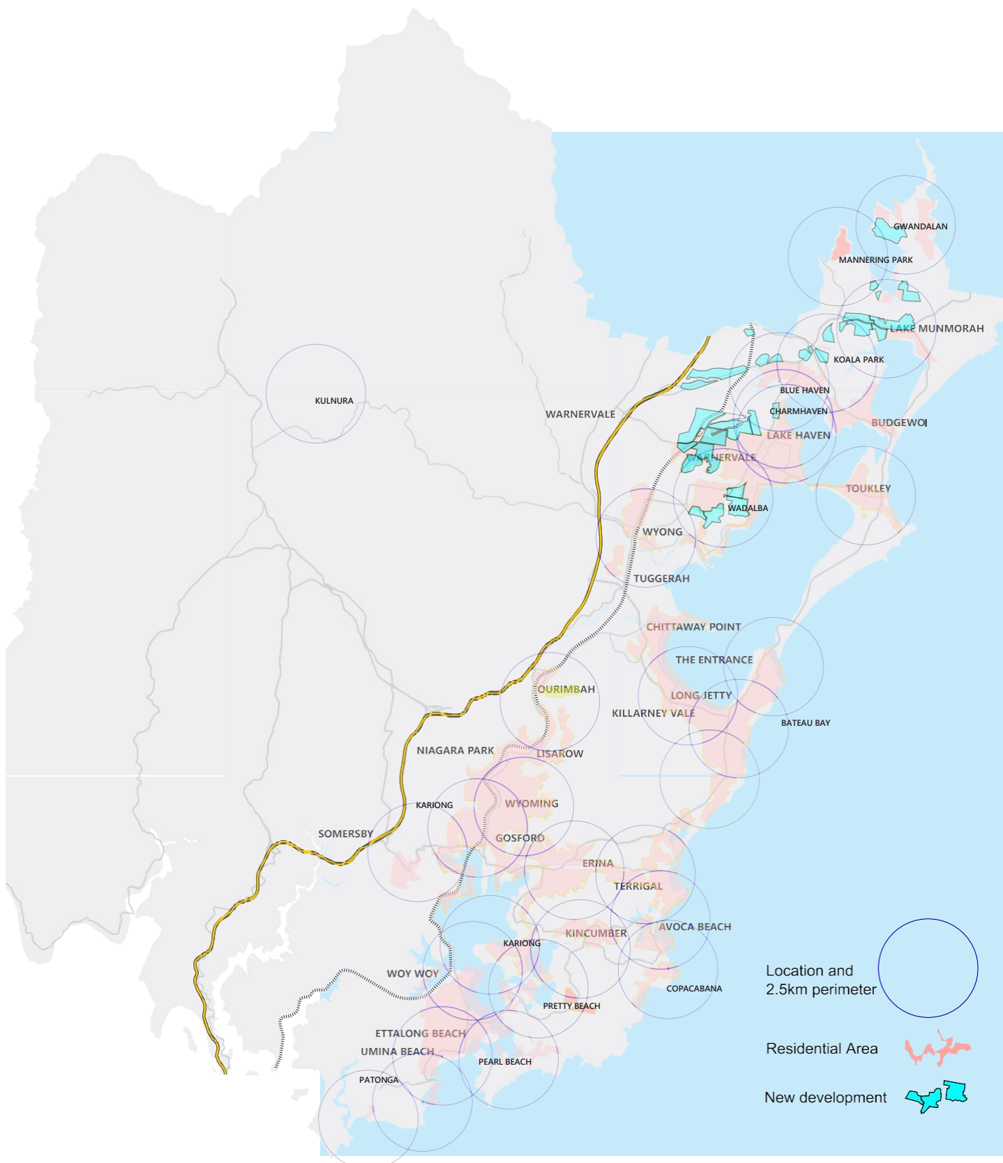
Figure 2: Sites related to existing and proposed residential development