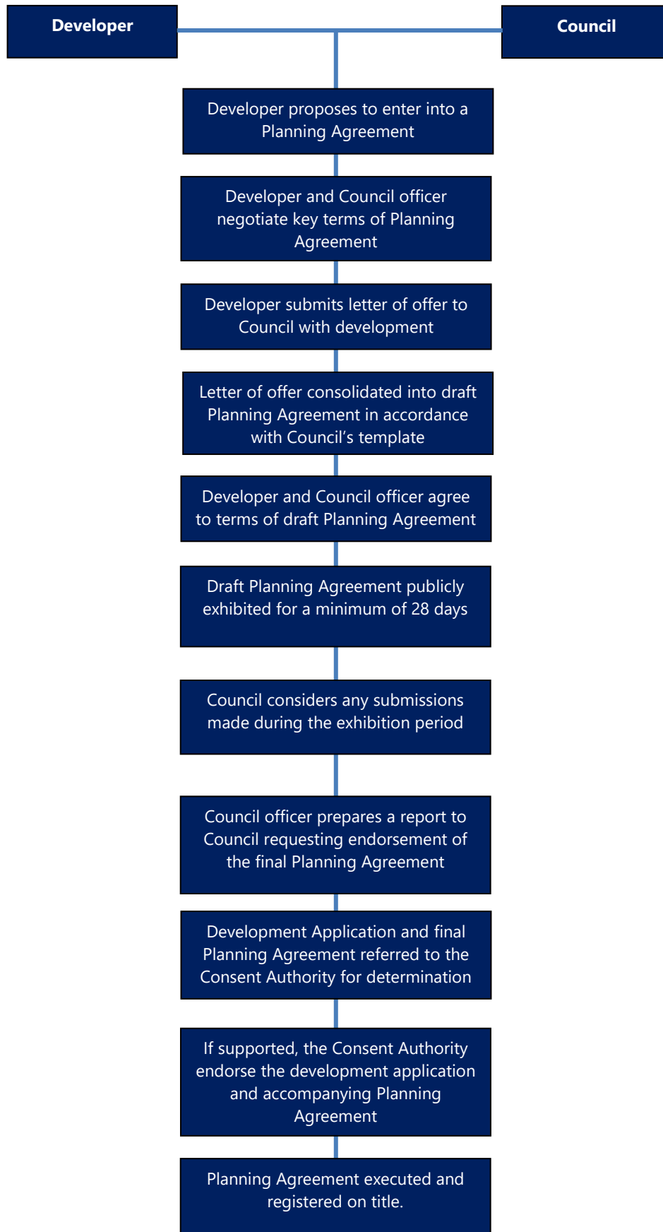
Figure 1 - Planning Agreement Process – Development Applications that include a Planning Agreement