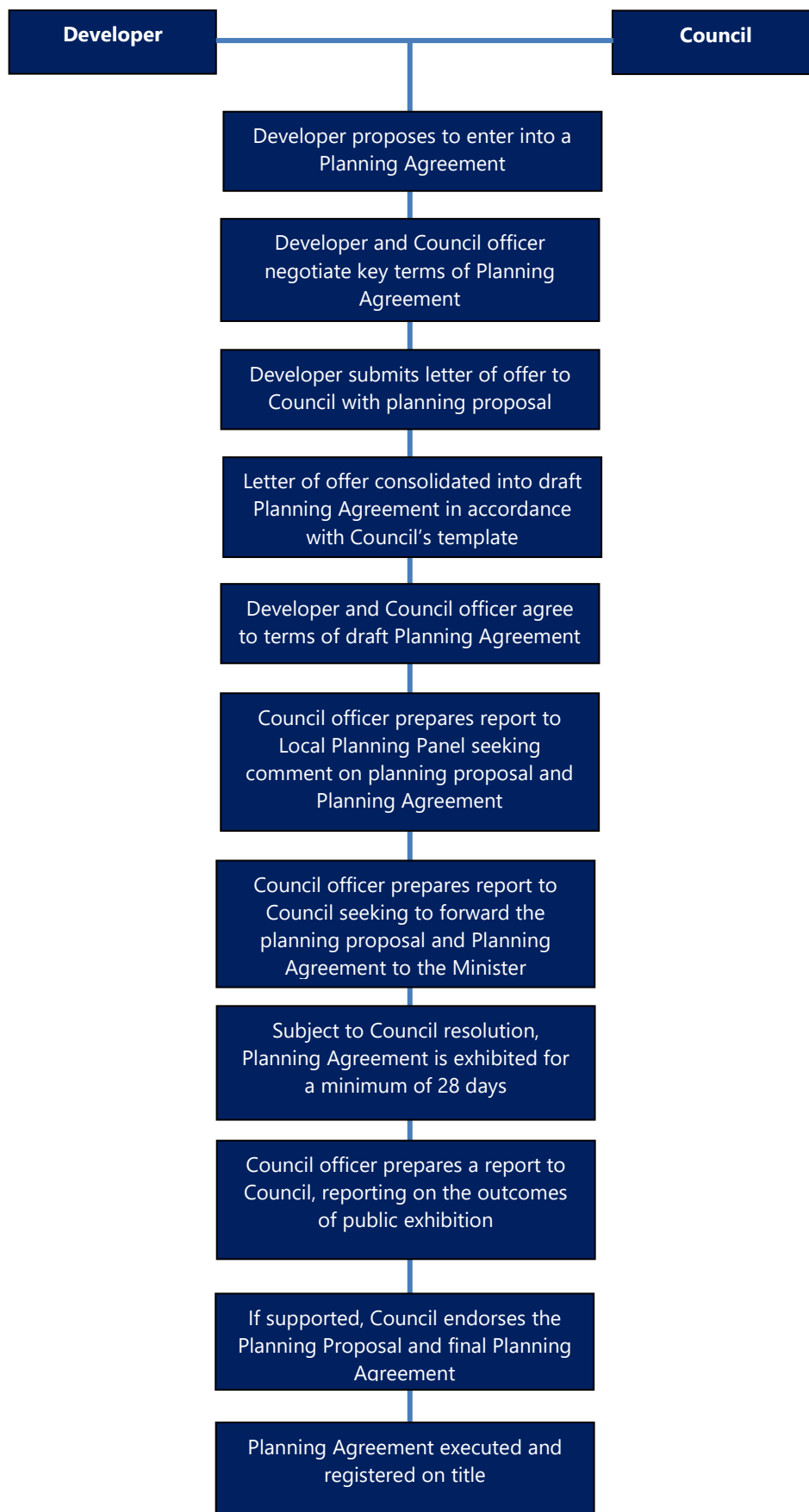
Figure 2 - Planning Agreement Process – Planning Proposals that include a Planning Agreement