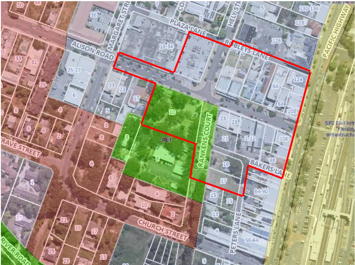
Figure 3 - Zoning Map