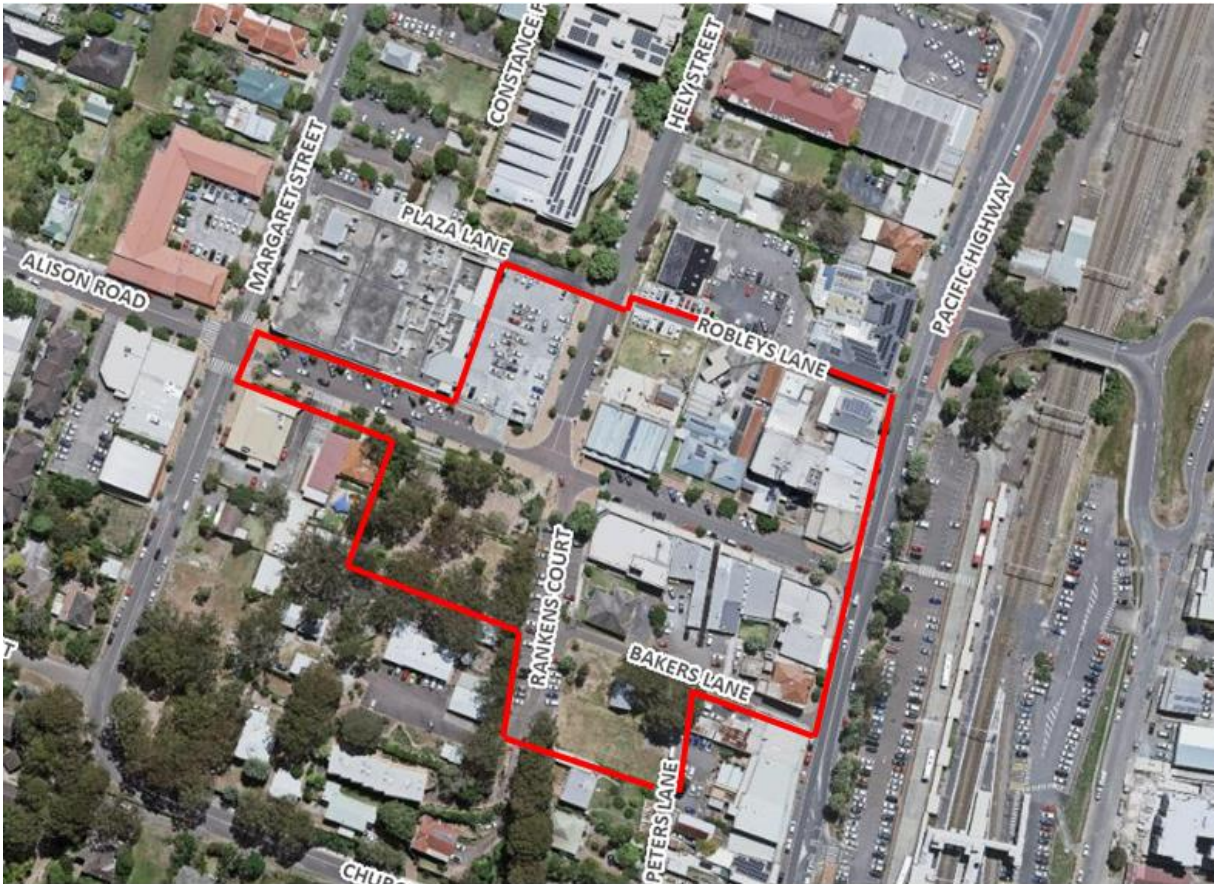
Figure 1 – Site Location