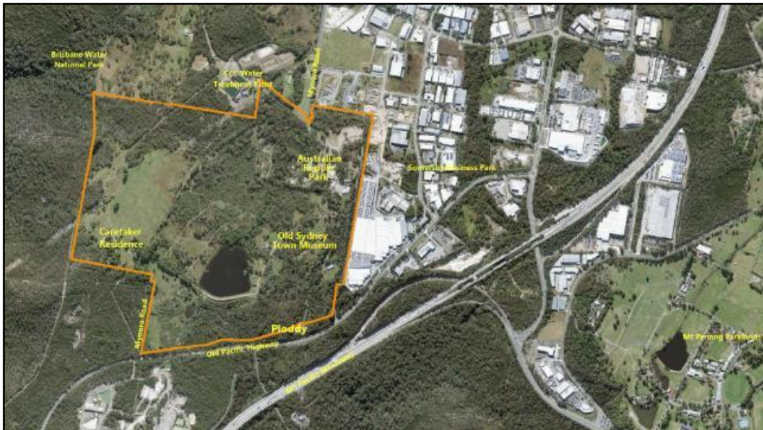
Figure 1 – Old Sydney Town Site (outlined in orange)

The Australian Reptile Park (ARP) is located at 66 Myroora Rd Somersby. As such, ARP are a tenant of the owners of the former OST site. The OST tourist facility ceased operation early 2003 and is currently tenanted by a caretaker. Remnants of the former use of the site remain in place in varying states of repair.