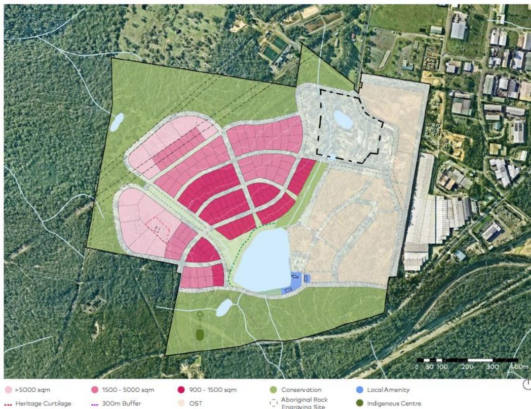
Figure 2 – Most recent proposed residential layout

In May 2024, a site inspection and subsequent workshop were held; the applicant provided several proposed residential layouts that still involve significant residential development consisting of 159 to 171 residential lots 900 sq. m to 5000 sq. m (see latest concepts in Figure 2 and 3).